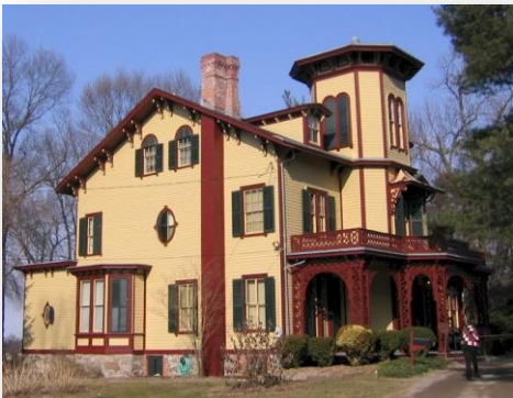
Acorn Hall, Morris County Historical Society

Friday, April 15, 2011, 10:00 am to 4 pm, and Sunday, April 17, 1:00 pm to 4:00 pm) Third Annual Revolutionary Weekend in Morristown, "Over Here and Over There: Morris County's Role in World War II – Preserving the Freedoms Won in the American Revolution"