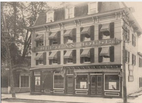
Bellingham's American House, Waverly Place and Lincoln 1907