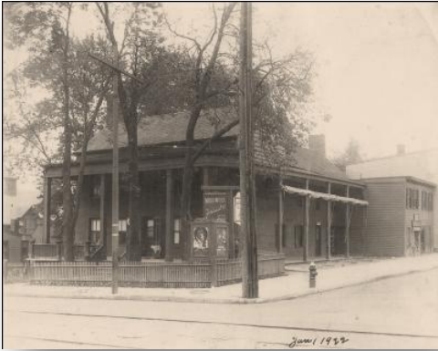
Bottle Hill Tavern 1922