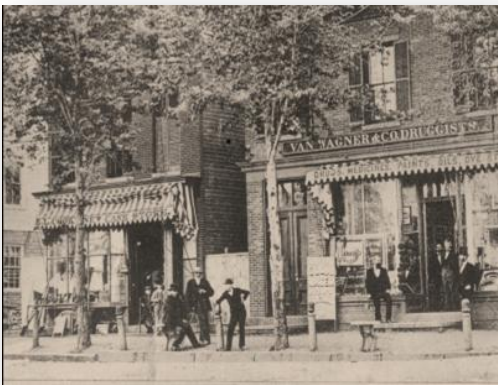
Southwest Corner, Waverly Place 1880