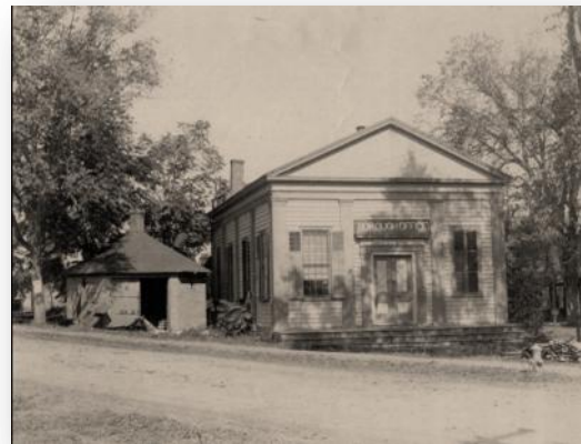
Presbyterian Sessions House, Park Ave. & Main, Later Borough Office and Jail